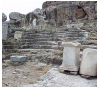
Portion of the Sanctuary at Eleusis.

of player-as-scientist. Long before science, probably even before language, the mystery religions were the method of transmitting knowledge, even technical knowledge. In the early form of the mystery at Eleusis, it’s probable that the initiate learned not only how Demeter went to the underworld in search of Persephone but also learned how to grow wheat, and this second idea was somehow intertwined with the first.” 2